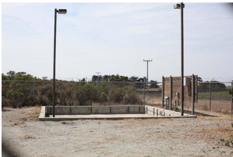
Site Conditions 31 August 2017

The former northwest treatment system (NWTs) site was inspected for the last time on 31 August 2017. No unusual conditions were observed at the former treatment site except for broken neutral service on the PG&E power pole. HGL reported that problem to PG&E on 05 September 2017 and PG&E notified us by text that they repaired it the same day.