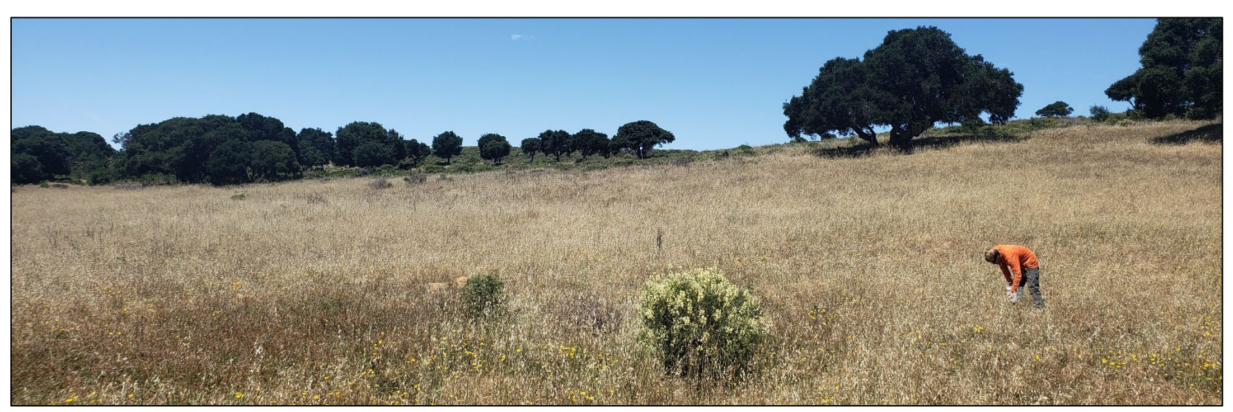
Figure 1: Biologist collecting sky lupine seed.