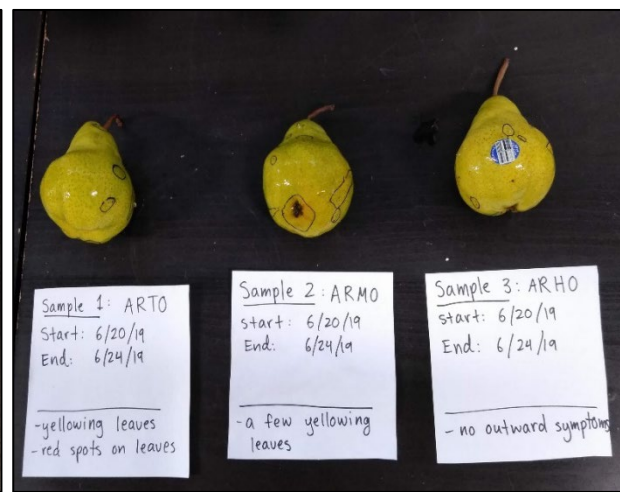
Figures 4, 5, and 6: Pear baiting tests were performed in June on three manzanita species. Test results were negative.