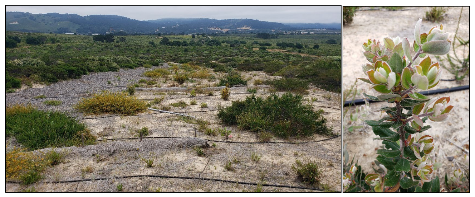
Figures 2 and 3: Overview and closeup of irrigated plants at HA 26.